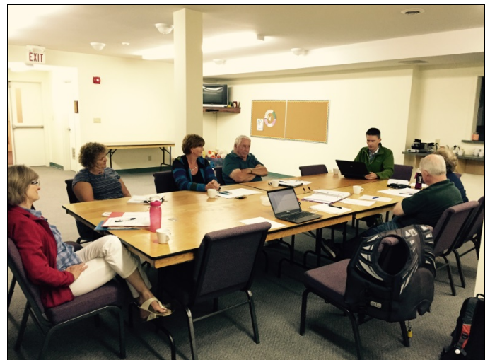
Picture from the Spring 2015 Board Meeting