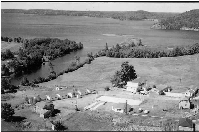
The Lodge c 1950